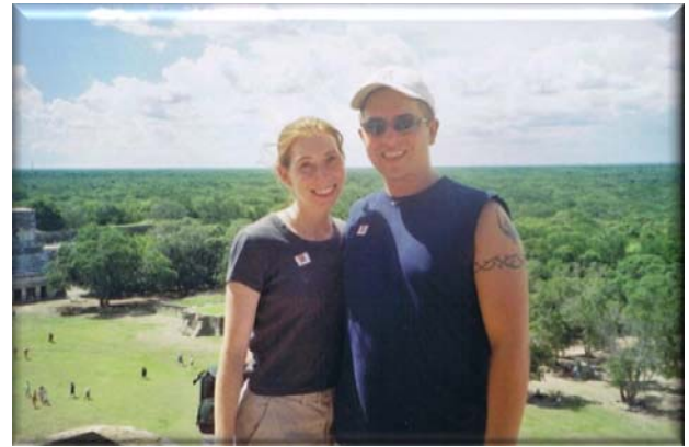
Mexican Ruins outside Cancun