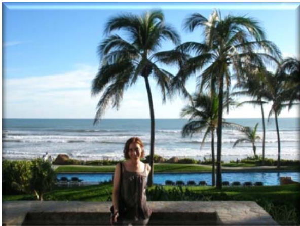
On the beach in Acapulco