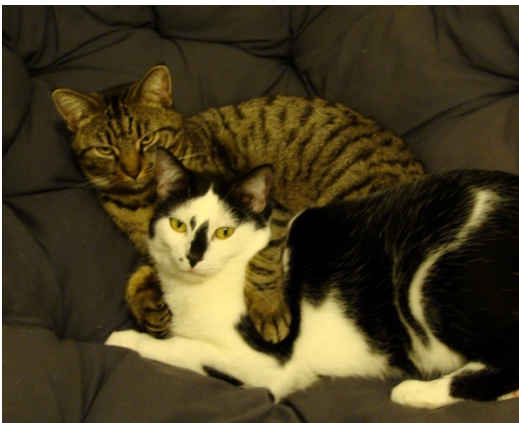
Venus and Zoe

Our two cats, Venus and Zoe, can usually be found lying in a sunny window, playing around or cuddling each other on a cozy chair or blanket. They are both very people-friendly, and will enjoy having a new family member in the house! We also have a beautiful Koi pond in the backyard. We also grow fruit and vegetables in the backyard such as blueberries, raspberries, peaches and tomatoes.