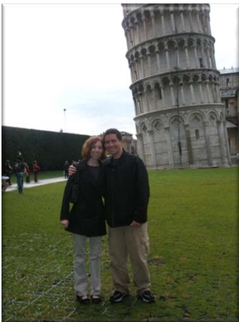
At the Leaning Tower of Pisa in Italy