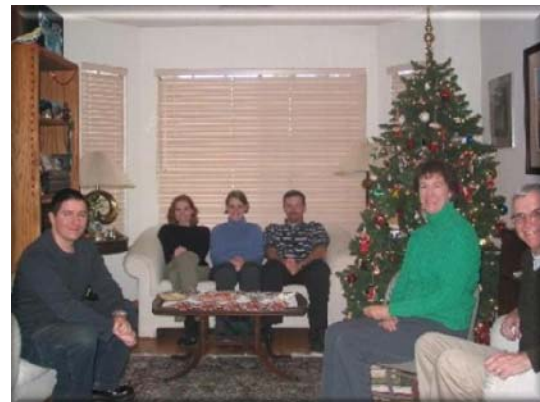
Christmas with family in Mountain View

We wish you the best with your decision and want you to be comfortable about your decision. If you have any questions, you may reach us through our adoption attorney, Nanci Worcester at 1-800-523-6781.