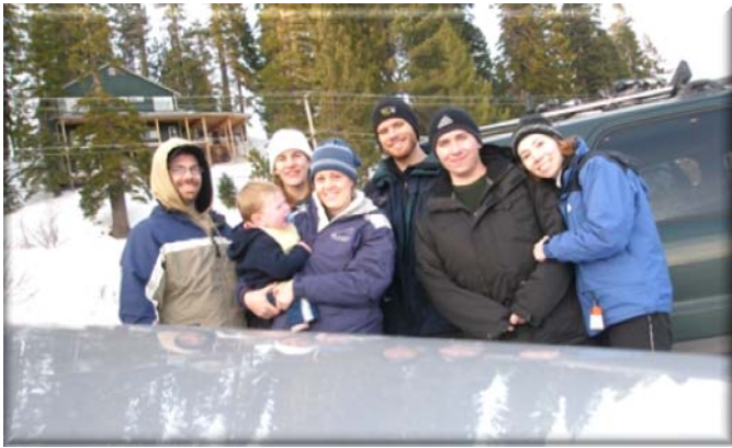
Skiing in Tahoe with Family